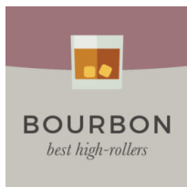
The Best High-Roller Bourbon