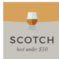
The Best Scotch Under $50