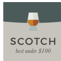
The Best Scotch Under $100