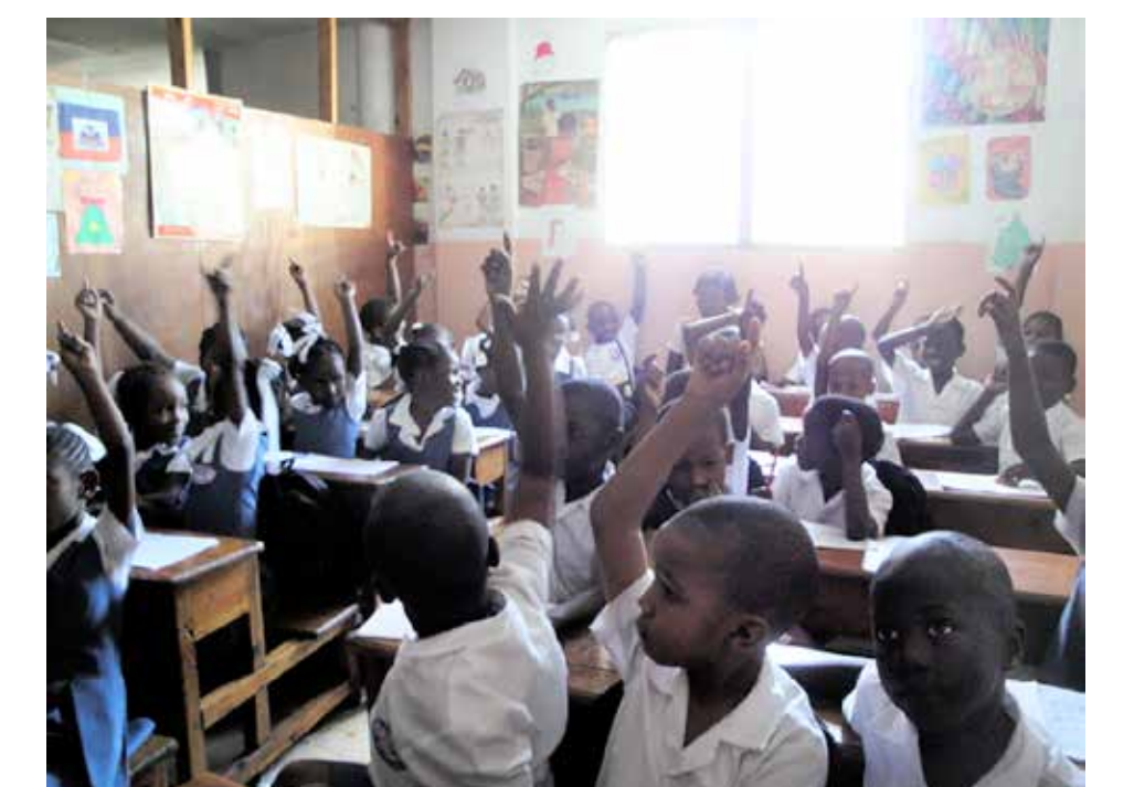
Second graders after being asked by Gettysburg students to raise their hands if they thought education was important.

people, and yet their hope and potential persist. The time our group spent in Haiti was focused not on how we knew what the Haitians didn't, but rather how we could learn from the Haitians. I am confident in saying I have gotten far more out of Haiti than I have given. Haiti is a country with so much to offer. As we learned on our trip, it needs dedicated leaders with heroic levels of patience. These leaders are already there. They are sitting in the desks and chairs of the cinderblock schools. We won't know the extent of their success for years to come, and yet we cannot wait to see it.