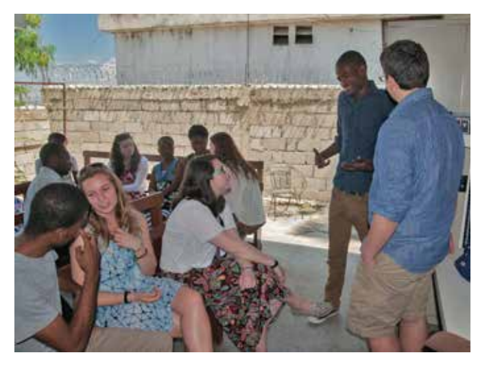
Gettysburg students meet their Haitian pen pals for the first time.

Haiti is a beautiful place. There are so many things working against the Haitian