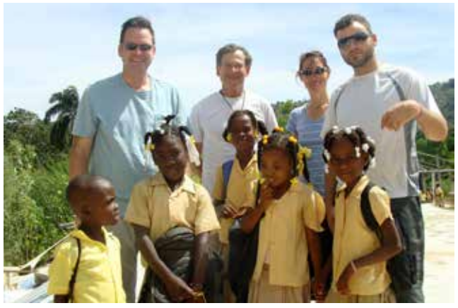
The delegation from Renton, Washington with some of the school children.

Our faith, and the faith of our partners, who have little else, sustains us. As a fellow traveler once put it: "We go to serve the people of Haiti, but are so much more greatly served by them."